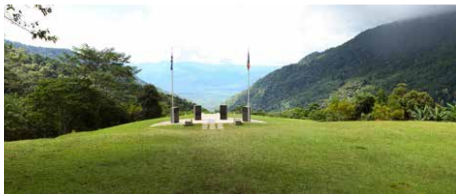
Trek the Kokoda Track with Back Track in 2019