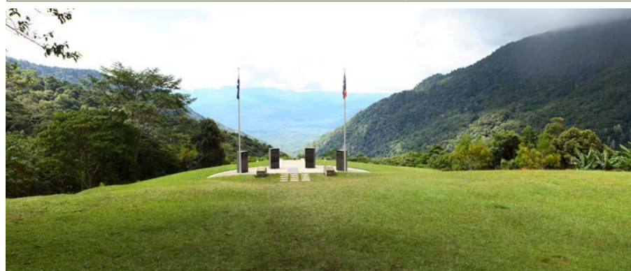
Trek the Kokoda Track with Back Track in 2019